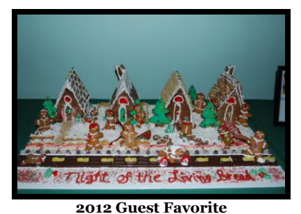
Gingerbread Grandeur creation from Zombie Burger

During the month of December, Salisbury House will showcase the clever creations of local bakers, architects and chefs with its 4<sup>th</sup> Gingerbread Grandeur silent auction. Salisbury House will display the gingerbread creations from November 26<sup>th</sup> - December 19<sup>th</sup>. The creations will be available for purchase through a silent auction benefitting the Salisbury House Foundation. Bidding ends at noon on December 19<sup>th</sup>. The 2013 Gingerbread Grandeur creations are being crafted by a professional division including: Carefree Patisserie, Design Alliance, Django, and Genesis Architectural Design. A celebrity division of Gingerbread Grandeur creations includes: Sabrina Ahmed – WOI-TV5, Michele Beschen – Simply Michele, Eric Hanson – KCCI-TV8, Van Harden and Bonnie Lucas – WHO radio, Drew Holmes – Urbandale Hy-Vee Store Manager, Colleen Kelly – Star 102.5, Mark Marturello and Michael Morain – Des Moines Register, Dan Wardell – IPTV, and Ed Wilson – WHO-TV 13.